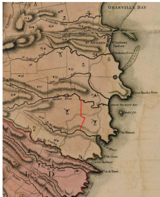
Figure 4: Meneré Sugar Estate (No. 82), 1763

1763 : 359 acres (112.4/76 quarres in canes) Meneré Sugar Estate (#82 on Pinel's map) with over 40 enslaved owned by Peter Fournellier on the rights of Henry Cassé.