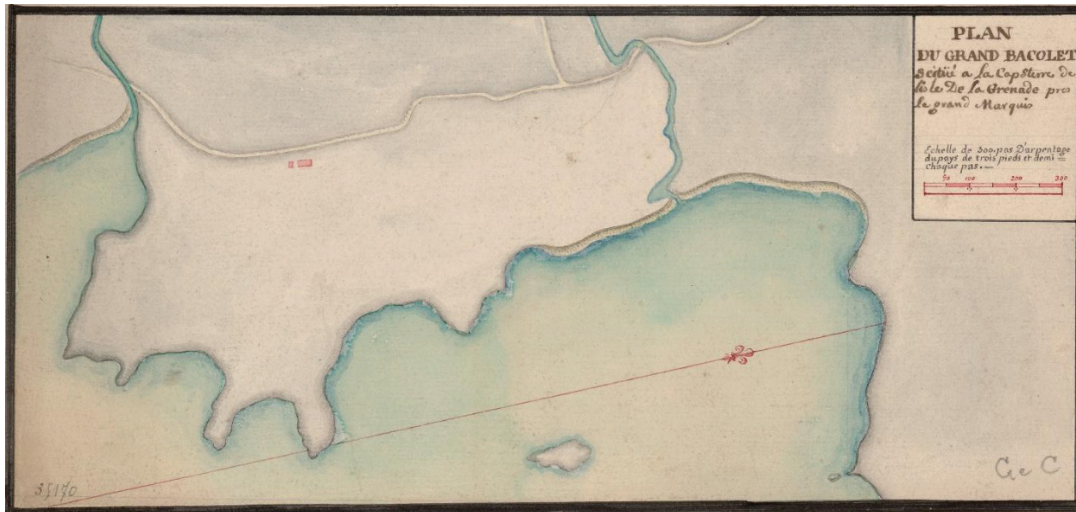
Figure 3: "Plan du Grand Bacolet scitué a la capsterre de l'isle de la Grenade pres la Grand Marquis," 1748 (courtesy BnF)

175? : 112.4 quarres Meneré Sugar Estate transferred from Cassé to Peter Fournellier.