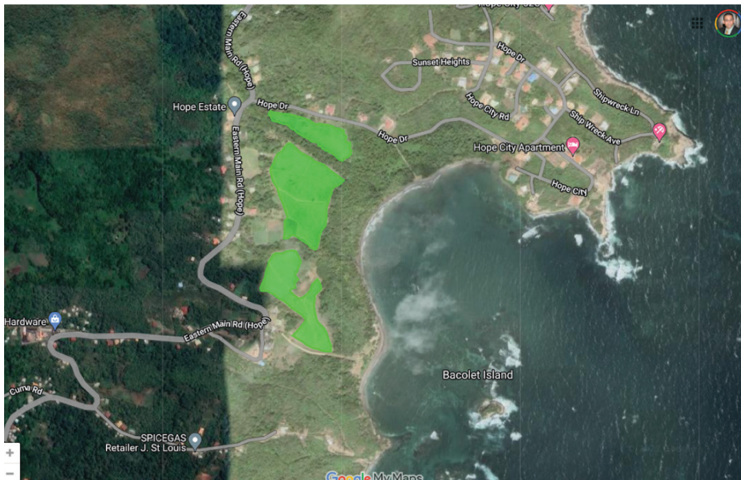
Figure 1: Google maps showing the Hope Sites 1, 2, and 3 (from bottom to top)

In 1875, three contiguous properties (Meneré/Furnillier's Bacolet/Munro's Little Bacolet, Hooke's Bacolet/Munro's Bacolet, and Chateau Gay/Mount Fan) were purchased and renamed Hope Estate, creating one of the largest estates on the island, with two sugar works (see Figure 2). The three plots referenced by Renegade Rum as Hope Sites 1, 2 and 3 derive from two different historical plantations. The two lower plots (Hope Site 1, 2) derive from the Meneré Sugar Estate, while the upper plot (Hope Site 3) derive from Munro's Bacolet Sugar Estate (see Figure 1).